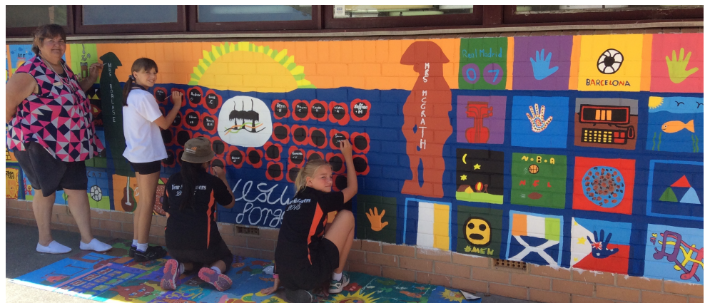
Our year 6 group leave their mark at Bungaree

Congratulations to our musicians, actors and choirs for working so well together to create a wonderful Christmas performance. We even had a visit from more than one Santa! Thank you to the Bungaree community as so many of you came and supported our performers, it really was a full house and you were a great audience!